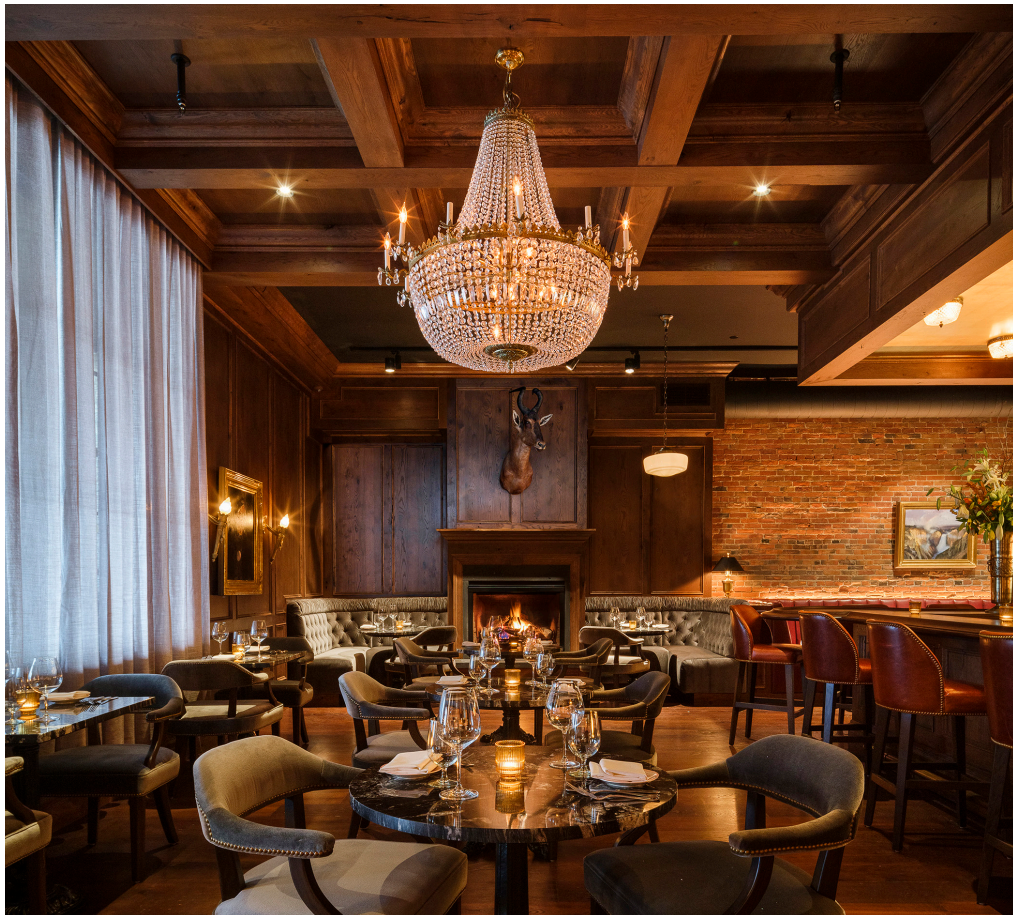
PEACE DESIGN, 2023 JACQUES BENEDICT AWARD WINNER