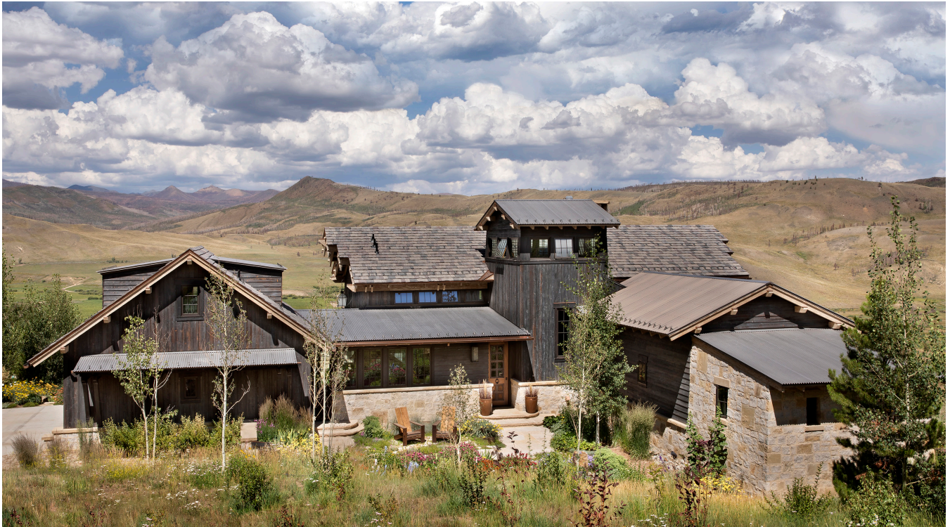
JEFFREY DUNGAN ARCHITECTS, 2023 JACQUES BENEDICT AWARD WINNER