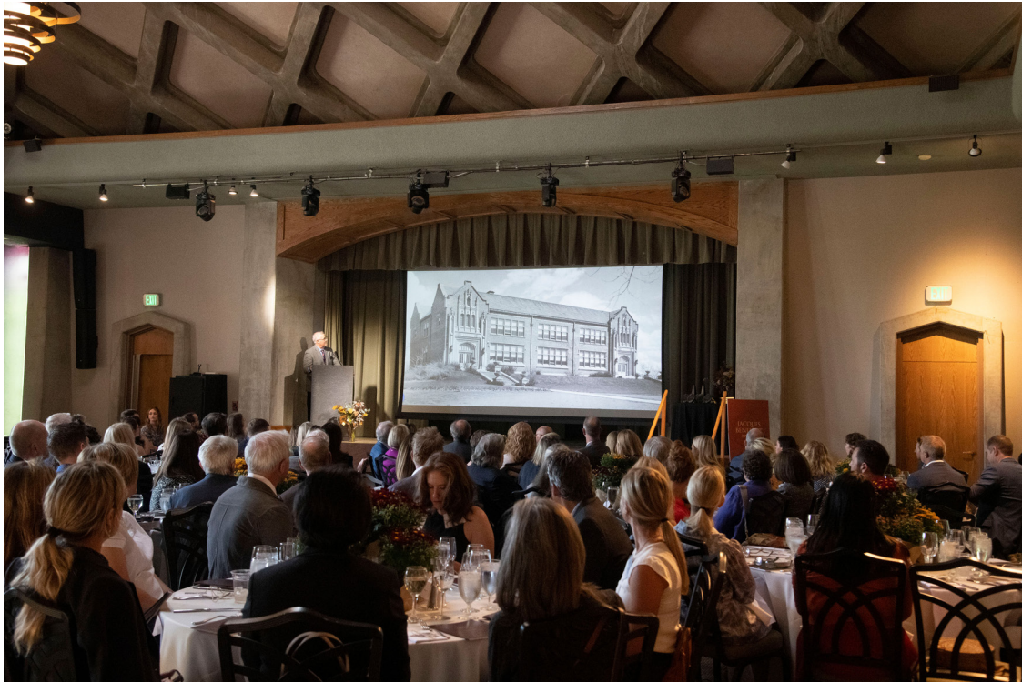
2023 JACQUES BENEDICT AWARDS