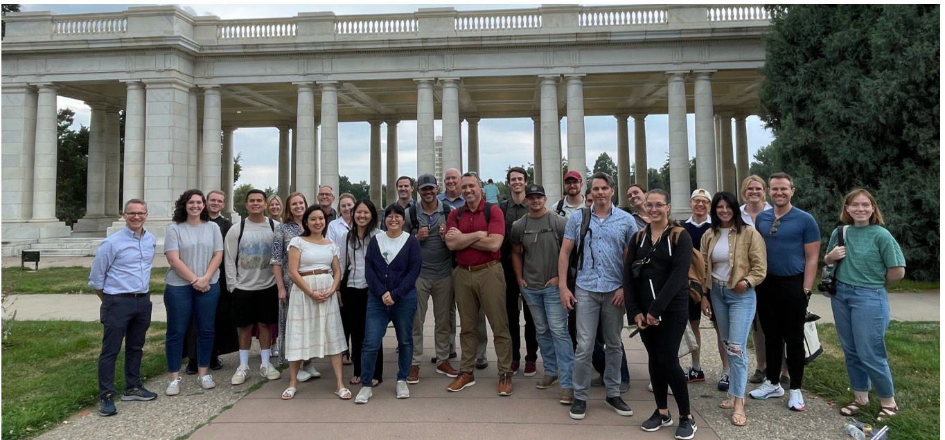
2023 REGIONAL INTENSIVE- DENVER