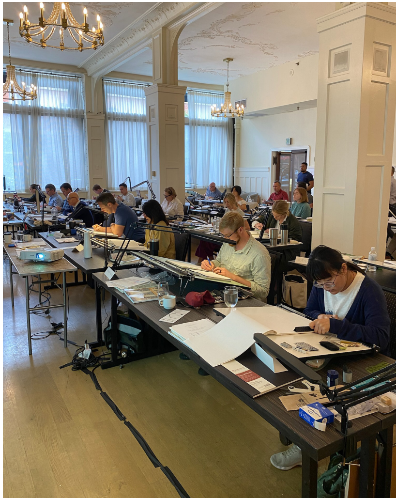
2023 REGIONAL INTENSIVE- DENVER